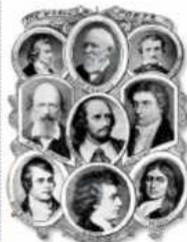
Illustration © 1998 by Pearson Education, Inc.